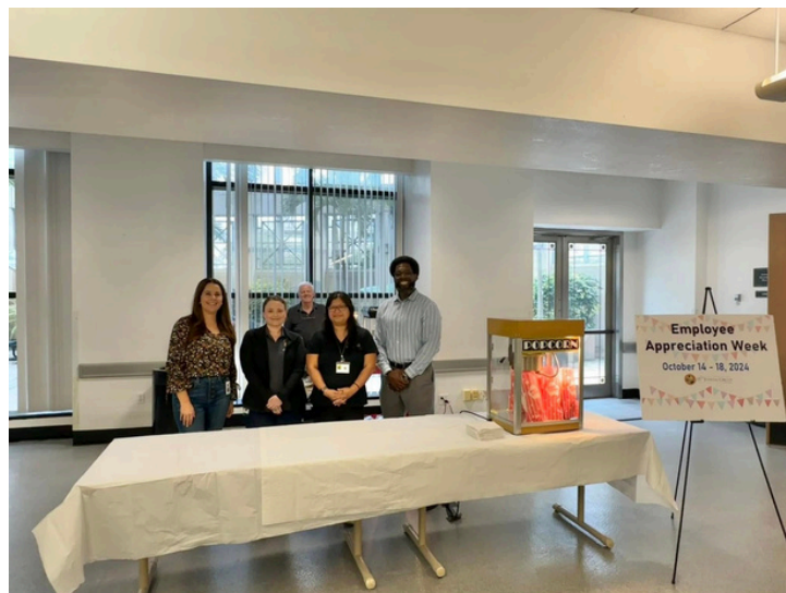
Court Administration staff serve up some fresh popcorn to Circuit employees