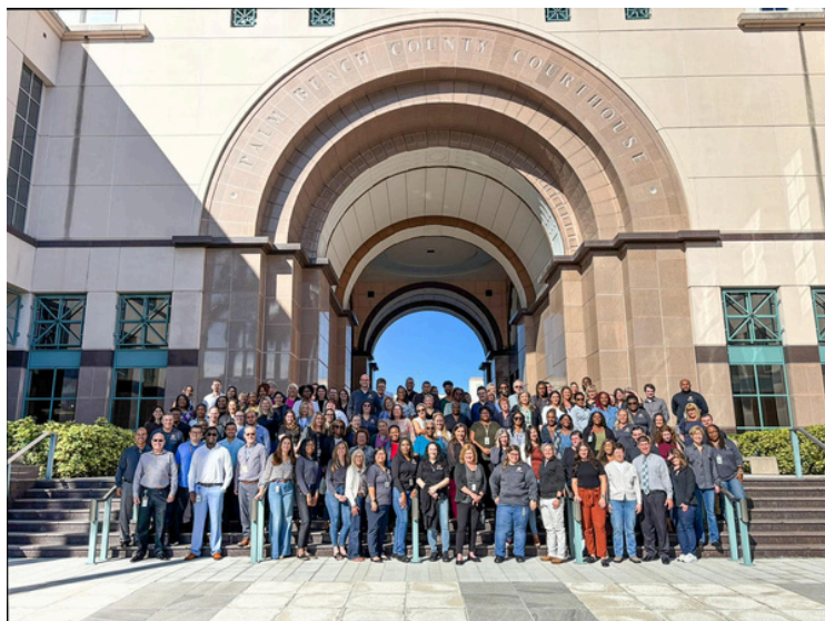
Group photo of 15th Circuit employees

The Circuit appreciates the employees’ dedication to assisting with the provision of justice for the citizens of Palm Beach County.