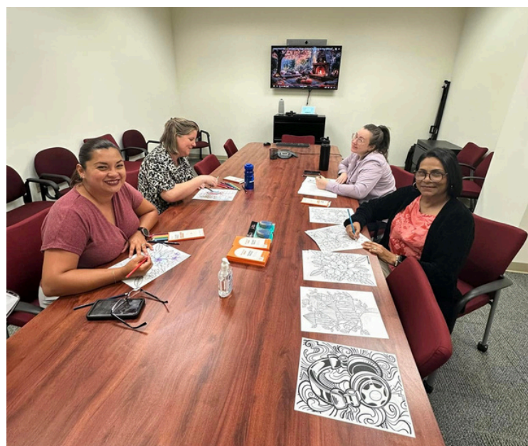
Circuit employees enjoying some adult coloring