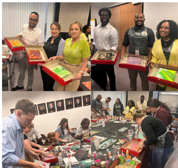
Circuit employees display their creativity with the acrylic painting activity